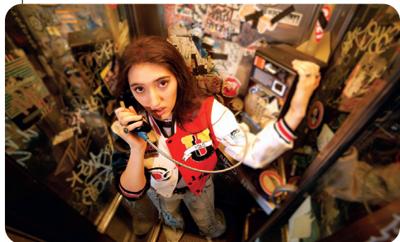
UNLESS I CALL SINGLE MUSIC VIDEO