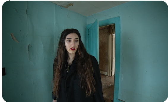
DISCONNECTED SINGLE MUSIC VIDEO