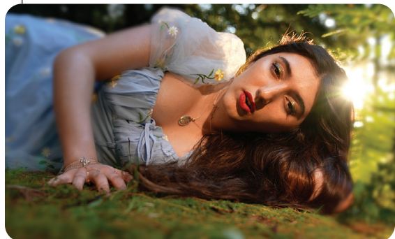
AGAINST THE WORLD SINGLE MUSIC VIDEO